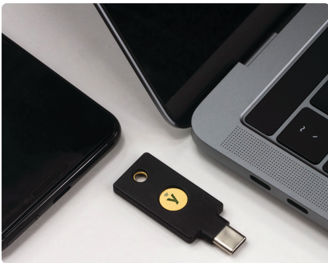
YubiKeys deliver strong user authentication across platforms and devices

Yubico is the principal inventor of the WebAuthn/FIDO2 and Fido U2F authentication standards adopted by the FIDO Alliance and is the first company to produce the U2F security key and a multi-protocol FIDO2 authenticator.